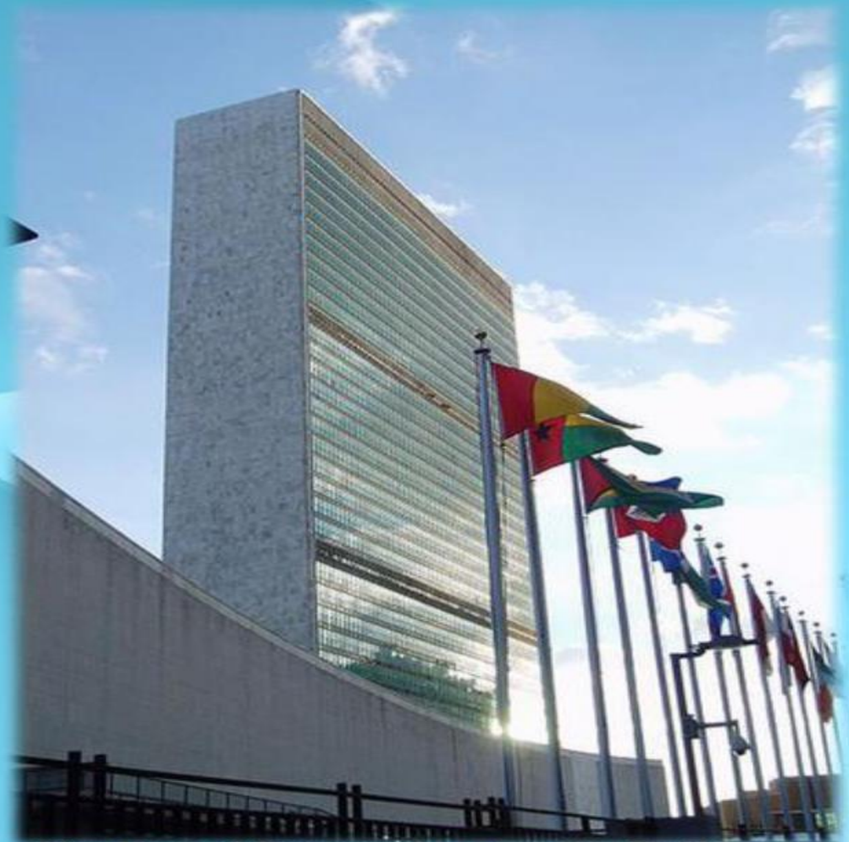
The United Nations Secretariat Building at the United Nations Headquarters in New York City.

The United Nations is the meeting-place where representatives of all member states great and small, rich and poor, with varying political views and social systems have a voice and an equal vote in shaping a common course of action. The United Nations has played and continues to play, an active role in reducing tension in the world, preventing conflicts and putting an end to fighting already under way.