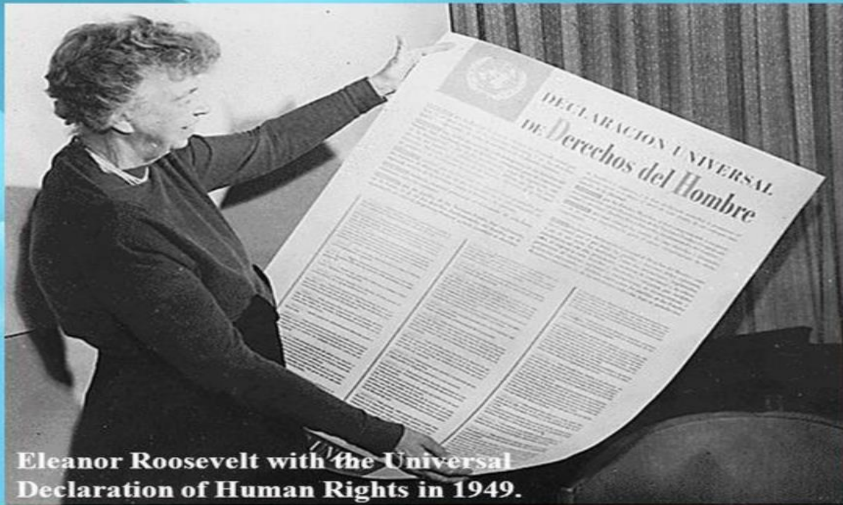
Eleanor Roosevelt with the Universal Declaration of Human Rights in 1949.

The UNO has as its central goal the maintenance of international peace and security. Additionally, its purposes call for the development of friendly relations among nations based on equal rights and self-determination of peoples and, through international cooperation, the solution of problems of an economic, social, cultural and humanitarian nature.